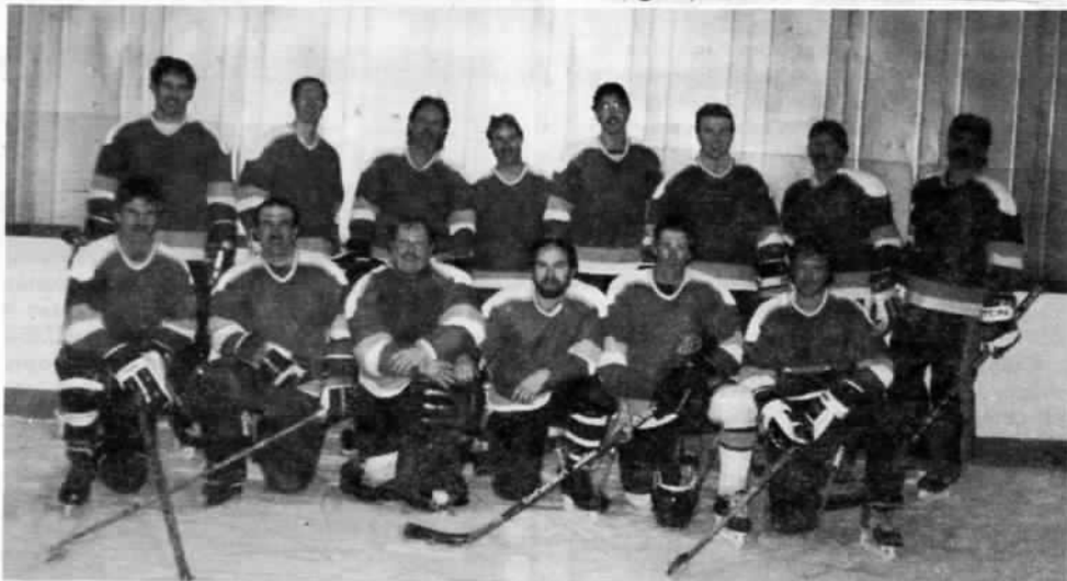
The S.E. Maulers