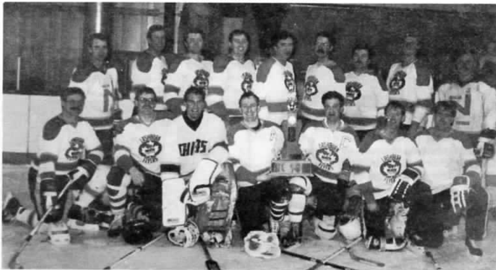
The 1978 Longplays